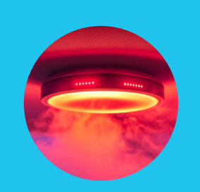
Feeling safe and reassured that the property is equipped with the latest fire alarm solutions, ensuring rapid response and effective fire control.