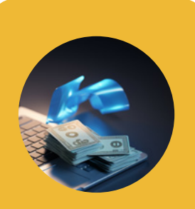
Reducing the costs of repairing equipment and devices and protecting them from sudden power surges or changes in electrical current that lead to their damage.

Prevent work and service disruptions by continuing to operate during a power outage as a continuous power source with a constant supply.