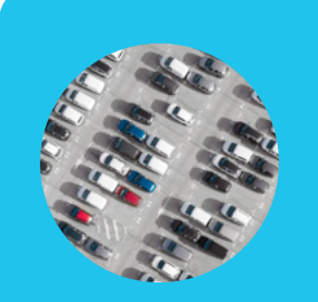
Increasing security by keeping an eye on parking spaces around-the-clock. This enables guards to monitor any unusual behavior coming from a specific car and follow it using cameras designed to identify license plates.