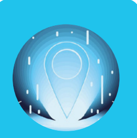
The system makes customers feel cared about and appreciated by sending reminders about their appointment, directing them to the correct location, and updating them if there are any delays via text and email.