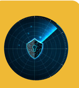
Protection against leakage or theft of vital information thanks to the system's ability to allow access to only authorized people.

Raising the level of security, especially when this system is integrated with the intrusion alarm system, fire alarm, and security cameras.