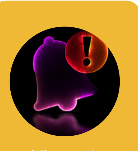
Providing early notice and alerts individuals about the possibility of a fire allows them to safely and quickly leave the area.

Preventing financial losses and minimizing fire damage; this lowers the possibility of building damage and lowers the cost of repair and replacement.